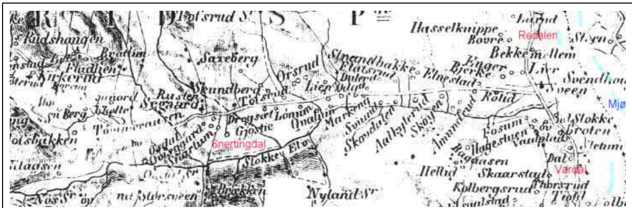
Map of the area surrounding the Onsrud farm in Snertingdal, Biri, Norway.

• TRUNCATED VERSION • ENTRIES MISSING BEYOND THE FIFTH GENERATION